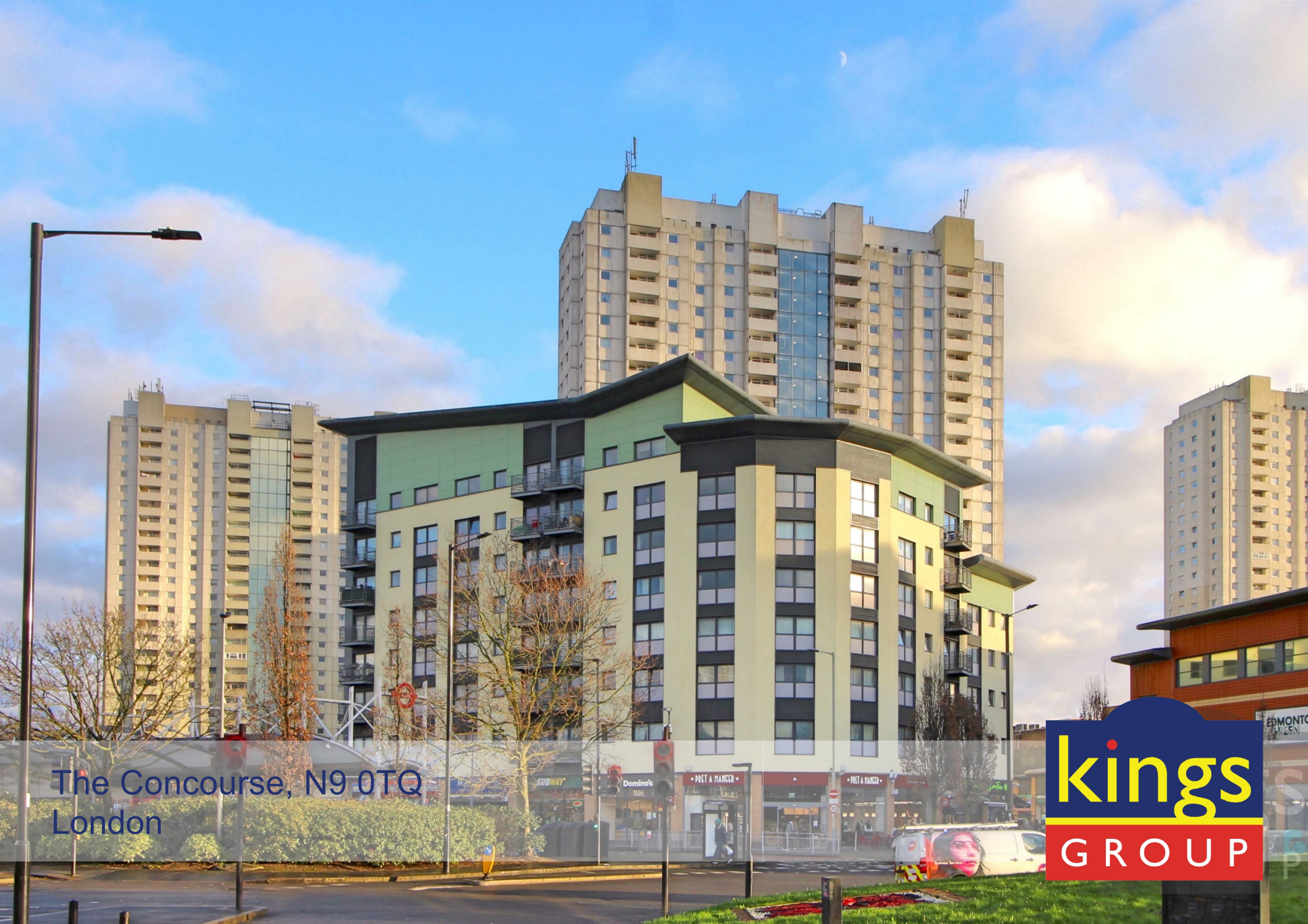
The Concourse, N9 0TQ London